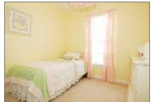
Sunny Rooms and Soft Colors Highlight this Home's Second and Third Bedrooms.