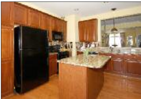
Kitchen Includes Flat-Top Stove, Refrigerator with Icemaker, Built-In Microwave, Self-Cleaning Oven, Dishwasher and a Beautiful Custom Tile Backsplash.