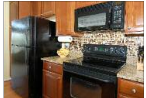
A Stunning Gourmet Kitchen with Granite Counters, Center Island Work Area, Cherry Cabinets and Lustrous Hardwood Floors.