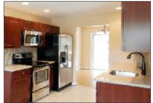
Remodelled Kitchen with Granite Counters, Brand New Stainless Steel Appliances, Recessed Lighting, New Wood Cabinets and a Ceramic Tile Floor and Backsplash