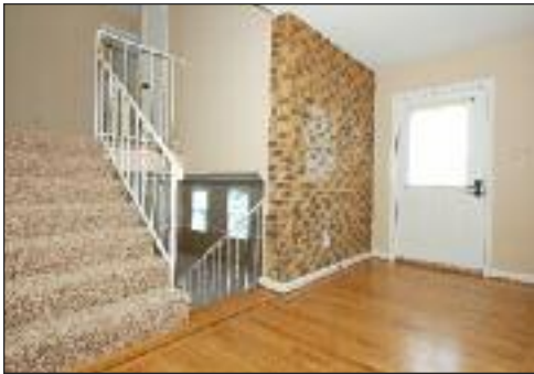
An Open and Airy Living Room and Dining Room Area with Hardwood Floors and Neutral Decor Opens to a Large Deck and Landscaped Yard