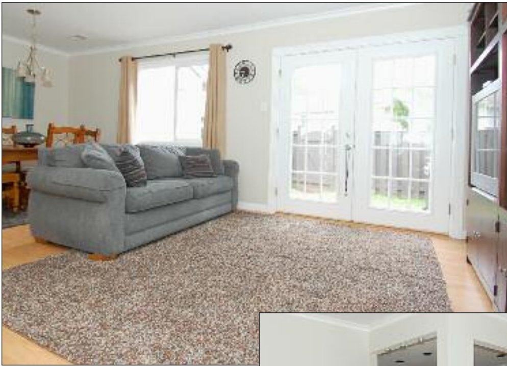
The Expansive Family Room and Dining Room Area Offers Light Pergo Flooring, Decorative Wood Trim and Beautiful French Doors Opening to a Fully-Fenced Back Yard and Patio.