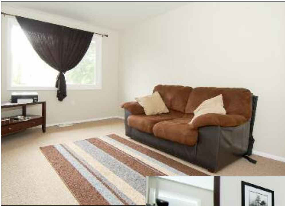
Two Additional Bedrooms Carry Through This Home's Neutral Decor and Both Have the Stylish Berber Carpeting and Large Windows.