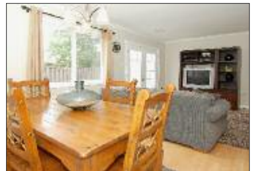
The Adjoining Dining Area Features Contemporary Lighting, a Large Window and Opens to the Kitchen for Easy Access.