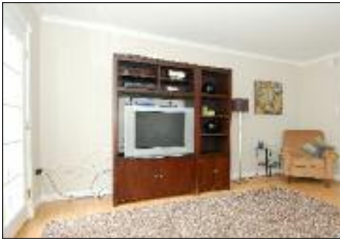
This Particular TownHome Has a Great Breakfast Bar and Plenty of Room for Those Huge Entertainment Centers.