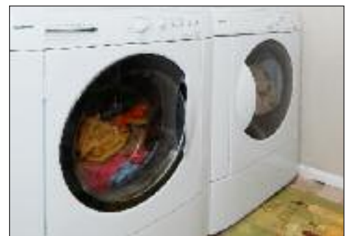
The Laundry Room Features a Front-Load Washer and Dryer. The Yard is Fully Fenced with a Secure Storage Area and a Roomy Patio Perfect for Barbecues.