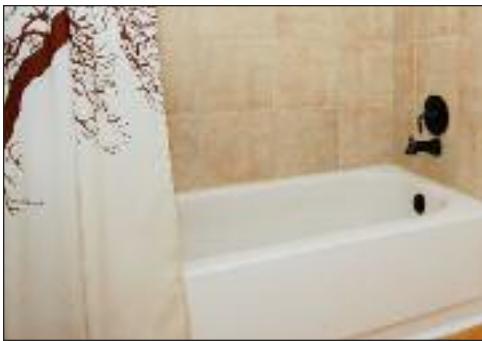
The Upper-Level Bath Also Has Been Totally Updated With a Modern Vanity and Fixtures – Plus Light Pergo and Ceramic Tile